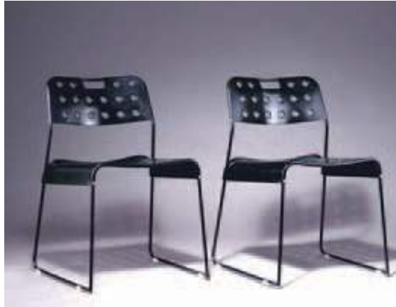
Figure 7: Kinsman OMK stack chairs

Used with the permission of OMK Associates.