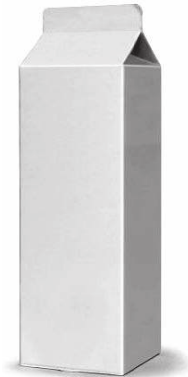
Figure 1: Gable-top carton