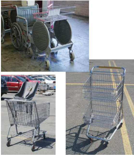
Figure 9: Range of shopping trolleys