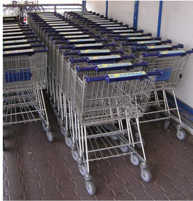
Figure 10: Shopping trolleys