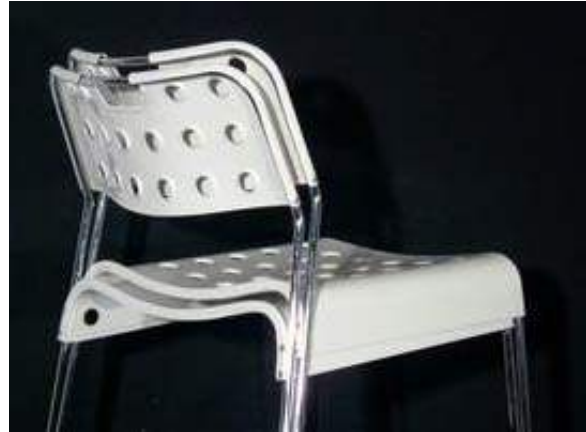
Figure 8: The chairs can be easily stacked